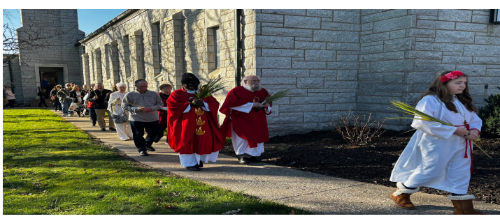
PALM SUNDAY AT HOLY ROSARY